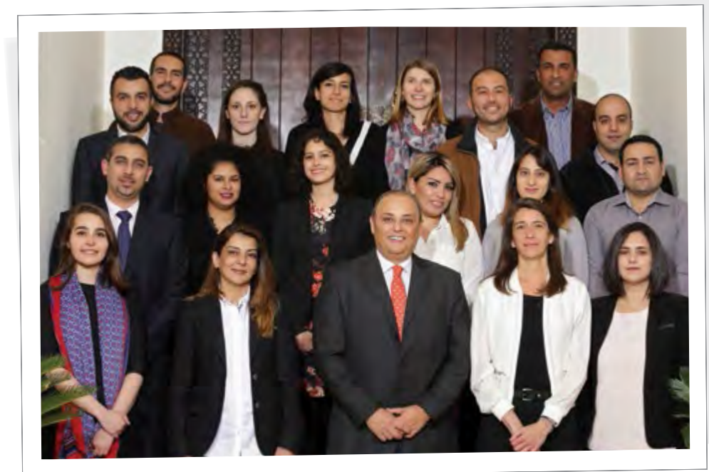
Team at the Columbia Global Centers | Amman

The Amman Center employs professional staff who manage programs, administer and oversee operations and logistics, and provide research assistance, and who are organized into several teams: the programs team, which pursues academic partnerships and develops programming in partnership with Columbia University schools; the administration team, which manages internal operations, finances and human resources; the communications team, which leads communications, media and outreach efforts and develops alumni relations; in addition to the operations team, which handles event management, information technology, as well as support for logistical, and maintenance-related tasks. The Center also houses Studio-X Amman, which investigates a wide range of issues in urban planning, historic preservation, and advanced architectural design in Jordan and the region.