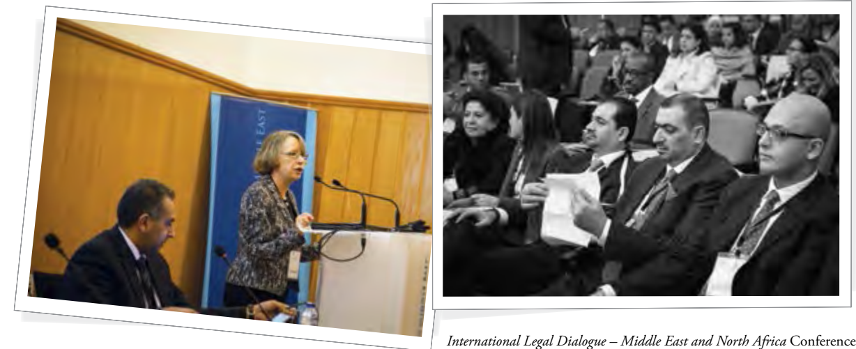
International Legal Dialogue – Middle East and North Africa Conference

The conference was the first of its kind in the region, and brought together local, regional and international speakers in the form of panel discussions on various timely international legal themes that are particularly relevant to the Middle East and North Africa. Some of the major issues and topics that were covered in the conference are arbitration, child abduction and protection, environmental effects of armed conflict, humanitarian law, and human trafficking in refugee situations. The audience engaged with the panelists on unanswered questions and controversial legal stipulations.