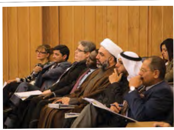
Religious leaders from across the region at opening session

Participants at the meeting in Amman spoke about their own experience and the various tools, mechanisms and programs they have used to counter incitement and hatred, evaluate them and identify ways of strengthening their impact. The meeting builds on the work already done by religious leaders in Fez, Morocco, who drew up a global Plan of Action for religious leaders to prevent incitement to violence that could lead to atrocity crimes and the Draft Fez Declaration of principles for religious leaders to follow. At a meeting of religious leaders from the European region in September, they developed a regional strategy to implement the elements of the plan that they felt were most relevant to that region.