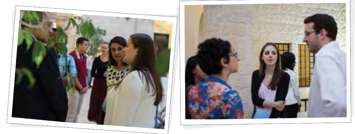
CEO students meet their mentors at orientation event

Throughout the internship, students explore a career field and develop professional skills, while gaining global experience. Students also had the opportunity to connect with professionals in Amman who have been selected to support the program either as an employer or mentor. The Center hosted an orientation lunch in June 2015 for students and mentors to connect.