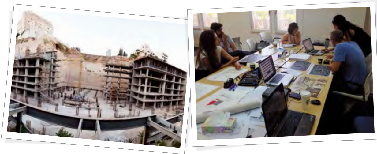
Suspended construction site in Amman