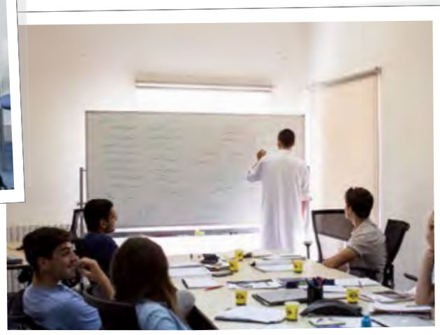
Middle East and North Africa Summer Institute in Amman