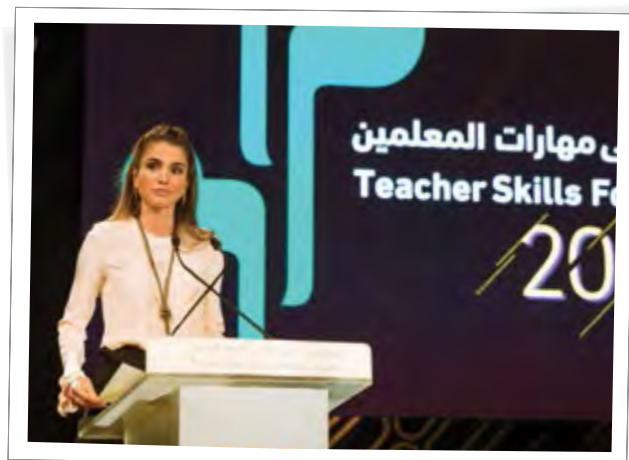
Her Majesty Queen Rania Al Abdullah addresses the Teacher Skills Forum

The Early Grade Reading and Math Project, a nationwide effort designed to improve reading and math skills from grades K-3 was also launched. The project seeks to develop and distribute improved learning materials to every K-3 classroom in Jordan, as well as to train teachers, principals, supervisors, and administrators to provide more effective instruction. The project, which will be carried out over the next five years, expects to deliver improved reading and math instruction to nearly 400,000 public school students.