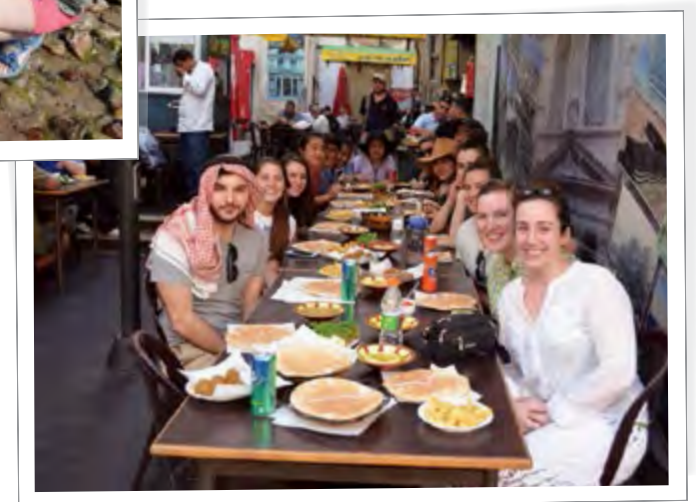
Columbia students enjoy a meal at a local restaurant