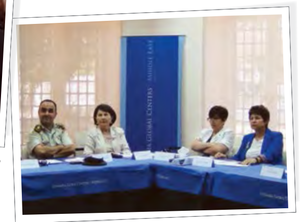
Nursing and midwifery roundtable with leading academics and experts