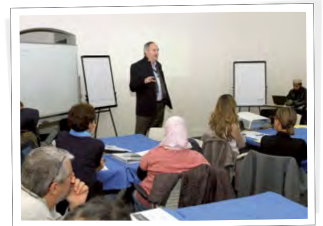
Session on coordinated public health response in emergencies

To address information management and data analysis gaps, an information system is currently being developed with the goal of providing state-of-the-art analysis of the child survival and development situation in conflict-affected countries in the Middle East and North Africa.