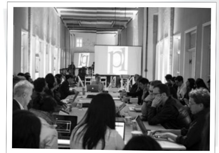
Studio-X Amman organizes Propositions workshop

Operating from the Columbia Global Centers | Amman since 2009, Studio-X Amman has developed several research and programming activities on questions of access, migration, representation, memory and citizenship. In 2015, Studio-X Amman continued to expand and build upon existing projects, as well as launch new ones.