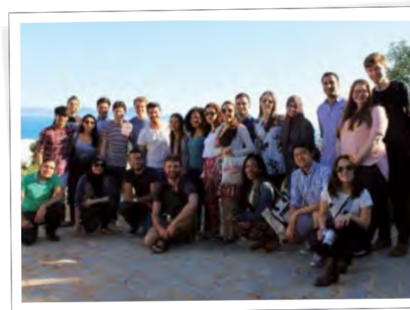
Students from Columbia and the region during program in Tunis