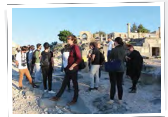
Echoing Borders' visit to site in northern Jordan