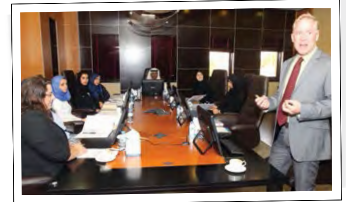
Discussion with the Family Development Foundation on social work priorities

Recommendations included technical assistance for staff and training for implementation of a Case Management Model for a comprehensive service center. Advanced courses to support evidence-based social work interventions and research methods have also been identified as priorities to continue to build a cadre of professional social workers in Abu Dhabi.