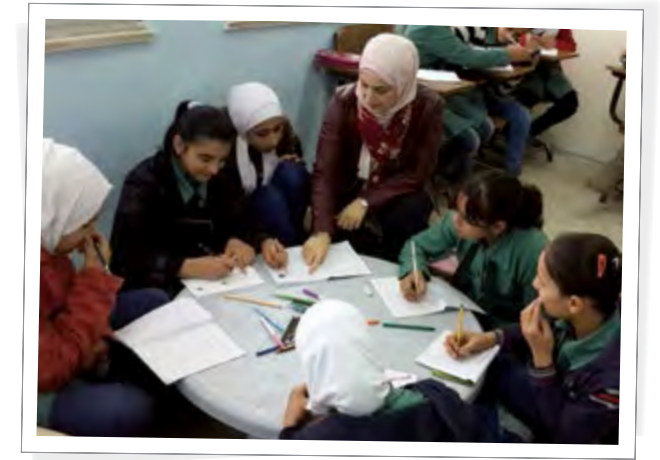
A QRTA-trained teacher with her students

Due to the growing number of training programs offered, QRTA continues to work closely with the Consortium for Policy Research in Education (CPRE) at Teachers College, to document the activities conducted in support of the networks, and their impact on practice, policy and performance. The documentation focuses on the use, adaptation, and sharing of the practices, lessons, units and tools acquired or developed through network activities, in order to allow for improvement of services, as well as tracking the design and enhancement of the school network strategy, and the use of new practices and sustainability over time.