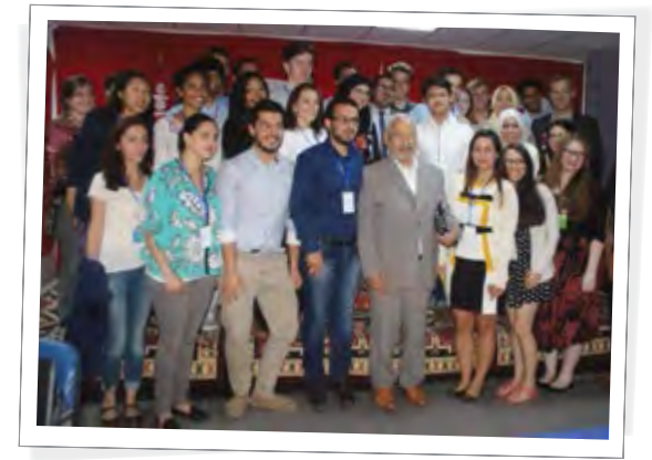
Group photo with Ennahda co-founder, Sheikh Rachid Al-Ghannouchi

Columbia University offered a new intensive three-week summer program in May-June 2015 focused on democracy and constitutional engineering in the Middle East. The program was organized by Columbia Global Centers | Amman, Columbia Global Centers | Istanbul, and the Office of Global Programs.