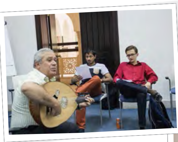
Students attend an Arabic music class

The second part of the program took place in Paris, whereby students continued to study Arabic and examine various themes. They were given the opportunity to learn Mashreki dialect in Amman and Maghrebi Darija in Paris. Both programs attracted 30 Columbia and non-Columbia undergraduate and graduate students, and 13 of them traveled on to Paris. The feasibility of moving part of the program to Tunis, ideally in the summer of 2017, is currently under consideration.